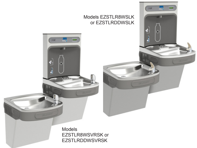
Models EZSTLR8WSVRSK or EZSTLRDDWSVRSK