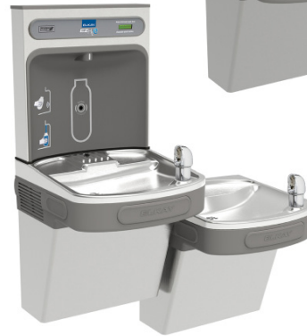
Models EZSTL8WSVRSK or EZSTLDDWSVRSK