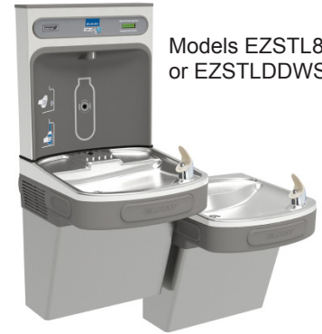
Models EZSTL8WSLK or EZSTLDDWSLK

2222 Camden Court OakBrook, IL 60523 630-572-3192 elkaypro.com