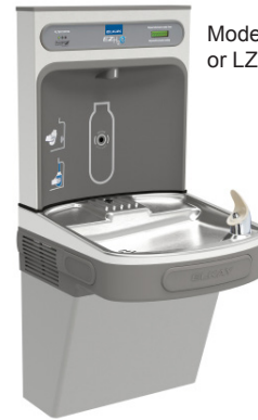
Models LZS8WSLK or LZSDWSLK