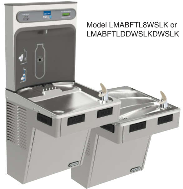
Model LMABFTL8WSLK or LMABFTLDDWSLKDWLSLK

In keeping with our policy of continuing product improvement, Elkay reserves the right to change specification without notice. Please visit elkaypro.com for the most current version.