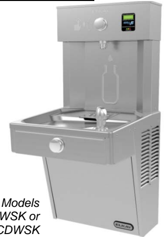
Models LVRC8WSK or LVRCDWSK